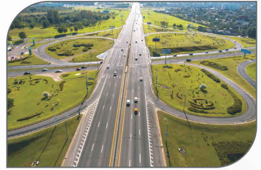
Regional Ring Road