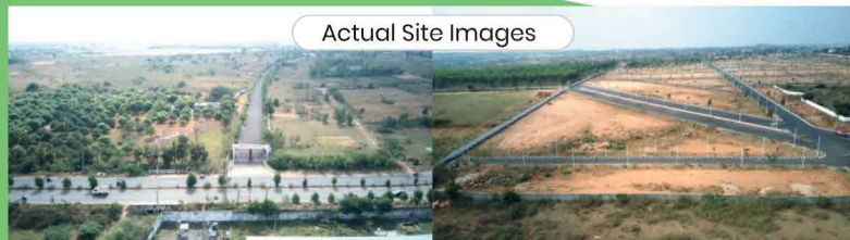
Actual Site Images