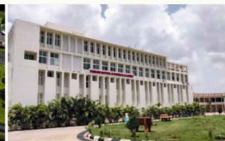
Symbiosis Institute of Management