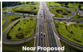
Near Proposed Regional Ring Road