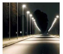
LED street lights