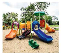
children's play area