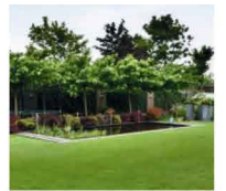
ample green space