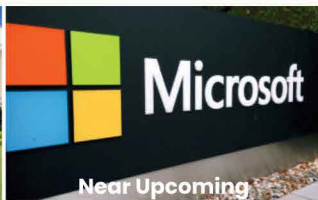
Near Upcoming Microsoft Data Centre